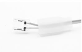
TL290-WL6FT Tape to wire with 6FT wire lead (10mm)