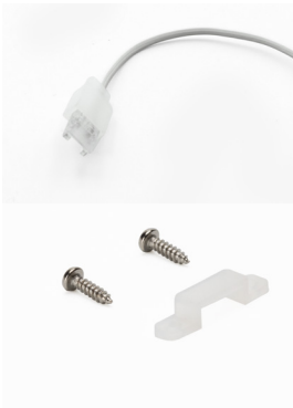
TL290-JOIN12 Tape to tape with 12inch wire lead (10mm)