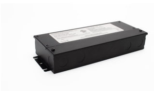
TLD24V-192W 192W Class 2 LED driver 100-277V input, 24V output x2 (2x 96W output) TRIAC, ELV, MLV, Forward & reverse phase, PWM output 1/2" knockout size Wet locations rated Dimensions: 10.9" x 4.3" x 1.8" (278mm x 110mm x 40mm)