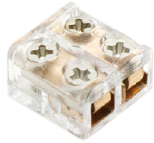
TL-STB-2-10 2-Pin screw connector terminal block (8-10mm)