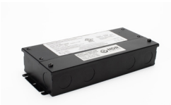
TLD24V-96W 96W Class 2 LED driver 100-277V input, 24V output TRIAC, ELV, MLV, Forward & reverse phase, PWM output 1/2" knockout size Wet locations rated Dimensions: 8.7" x 3.7" x 1.6" (220mm x 94.5mm x 40mm)