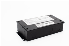
TLD24V-30W 30W Class 2 LED driver 100-277V input, 24V output TRIAC, ELV, MLV, Forward & reverse phase, PWM output 1/2" knockout size Wet locations rated Dimensions: 6.5" x 3.7" x 1.6" (165mm x 94.5mm x 40mm)