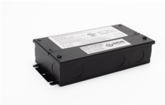
TLD24V-60W 60W Class 2 LED driver 100-277V input, 24V output TRIAC, ELV, MLV, Forward & reverse phase, PWM output 1/2" knockout size Wet locations rated Dimensions: 7.4" x 3.7" x 1.6" (188mm x 94.5mm x 40mm)