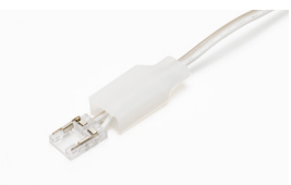
TL-WL6FT-COB67 Tape to wire with 6FT wire lead (10mm)