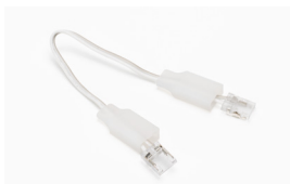
TLJOIN12-COB67 Tape to tape with 12inch wire lead (10mm)