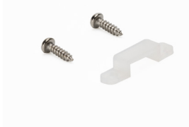
TL-CLIP-COB67 Silicon mounting clips with screws