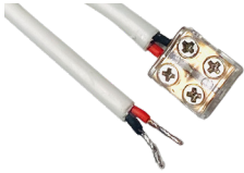
TL-EXT6FT-2-10 2-Pin Screw Connector - 6 Foot Extension (8-10mm)